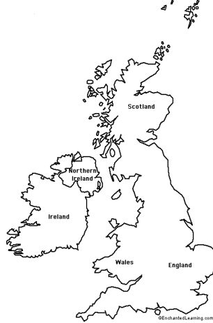
The United Kingdom